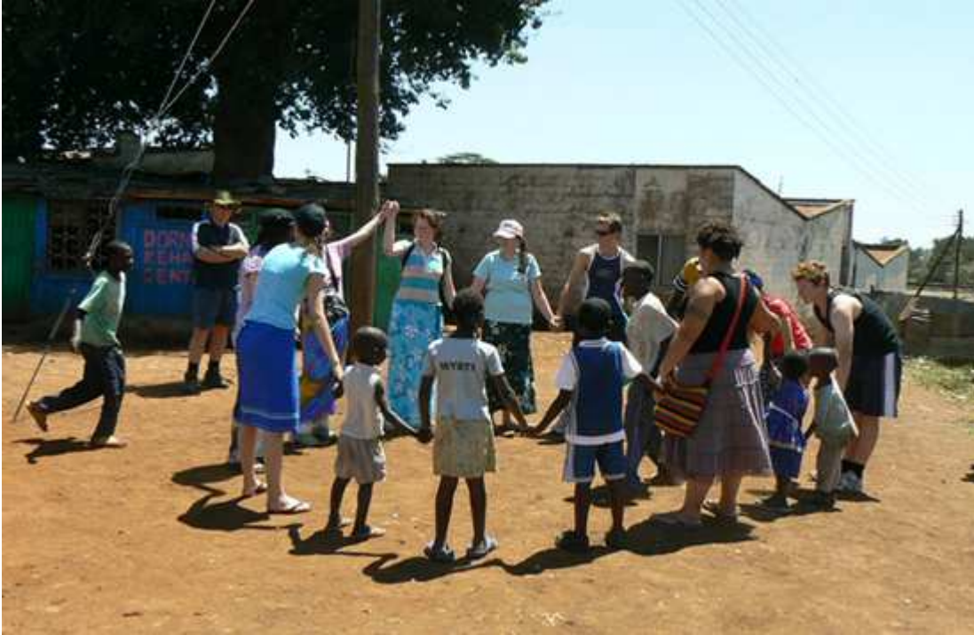
Service through Missions Team working with children from Kibera slums, Kenya